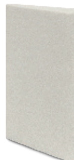
No. 6A Arkansas Thick Wedge | SS6A Hard Fine Grit Rounded edges for optional contouring. 4" x 1-7/8" x 3/8" down to 1/8"