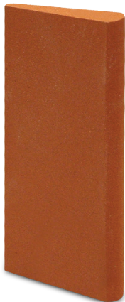
No. 6 I-Stone Wedge Shape | SS6 Medium Grit Follow with fine or super-fine grit stone for finishing. 4-1/2" x 1-7/8" x 3/8" down to 1/8"