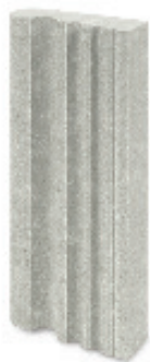
No. 5 Arkansas Bates | SS5 Hard Fine Grit Channeled stone for use with explorers, scalers, carvers and disc-shaped instruments. 4" x 1-1/2" x 1/2"